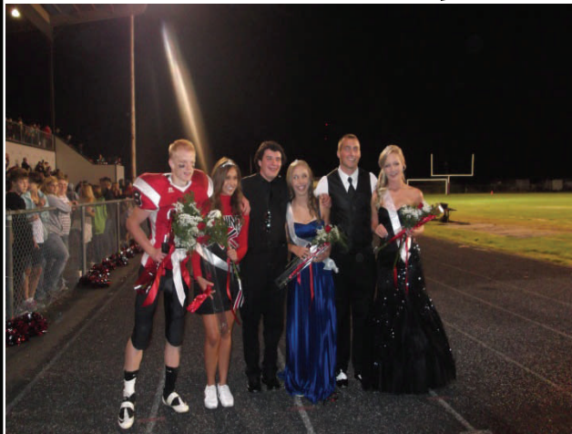
Athletics and Co-Curricular Activities like Homecoming are supported through levy dollars!