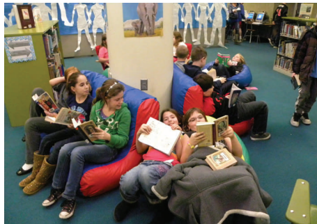
Tenino students enjoying reading time in the Library!

A. NO. A senior citizen would not have to pay if he or she has an income of $35,000.00 or less per year, is 62 years of age or older, or disabled. If a senior citizen qualifies and would like an exemption, he or she must file an exemption request with the County Assessor. Call 360-867-2200 for details.