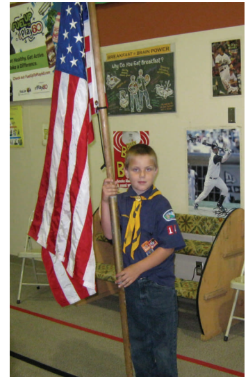
Proud Penguins at Parkside Elementary School prepare for the flag salute.