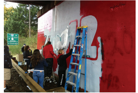
Tenino High School Students give the train trestle underpass a much needed facelift.

The district goal is to establish a consistent rate per $1000 of assessed valuation, ($3.37) for the 4 years of the levy. Any fluctuation in that rate is driven by property value changeability and the collection limits that are established by the State of Washington.