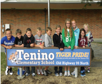
Tenino Tiger Pride shows at TES every day!